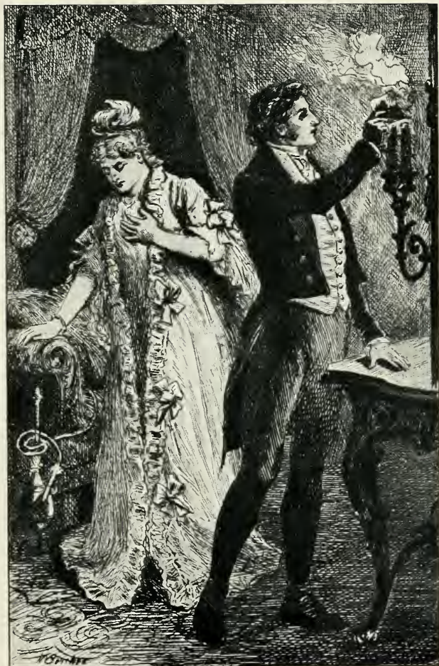
Lucien burnt the note at once in the flame of a candle.